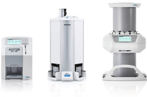
Image plate size 1, size 3, 2 pcs each Image plate size 4, 1 pce Light protection cover size 1, size 3, size 4, 100 pcs each Bite block protector size 4, 100 pcs 2141-007-00