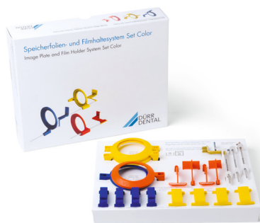
Image Plate and Film Holder System Set Color

Image plate holders from Dürr Dental offer optimum protection for the image plate with their smoothed and rounded edges. The special stepped design of the right-angle technique Color aiming rings enables simple and safe aiming of the X-ray tube. Holders are available for all applications – their use helps to ensure that accurate X-ray images are produced. The colour coding of the various image plate holders enables simple and error-free handling.